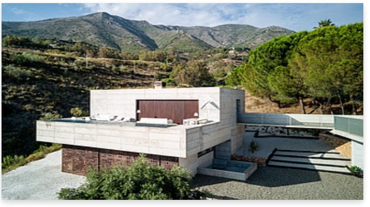
Luxury contemporary villa with minimalist design in the Valtocado Urbanization, Mijas